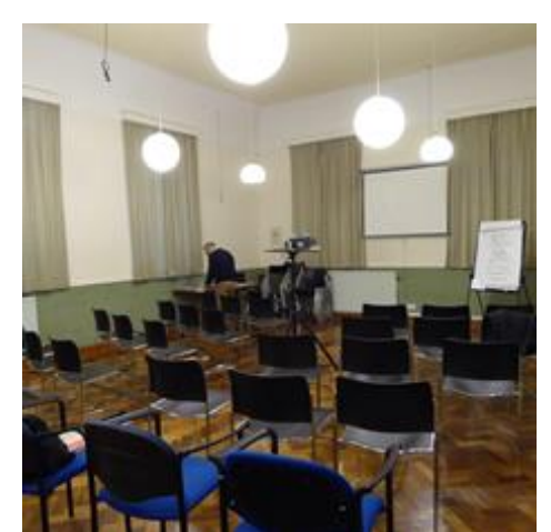
Figure 3: Large meeting room interior

The meeting house was built in 1956 from designs by J. L. Denman. It is built of multicoloured brick laid in stretcher bond under steeply-pitched tile roofs and consists of two elements: a large rectangular meeting room of vernacular Georgian character, with a hipped roof and large multi-paned sash windows under cambered heads and with raised and angled tile surrounds, and the smaller rooms and warden's accommodation, arranged in two storeys and of a more domestic, Arts and Crafts character, with a gambrel roof, hipped dormers, bay windows, casements and leaded lights. The windows are double-glazed replicas of the originals. The main entrance is placed off-centre between these two elements, the timber boarded doors with arched top and side lights set within an arched recessed porch.